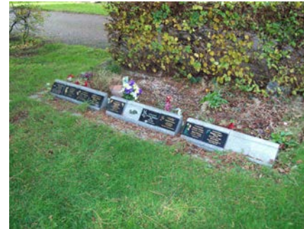
Western Memorial Garden 3