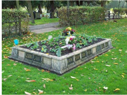
Western Memorial Gardens 1 & 2

Western cemetery offers two different styles of granite memorial plaque. Please indicate your preferred option.