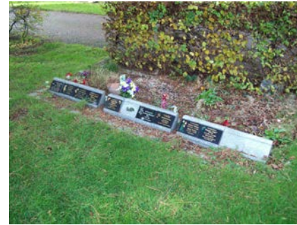
Western Memorial Garden 3